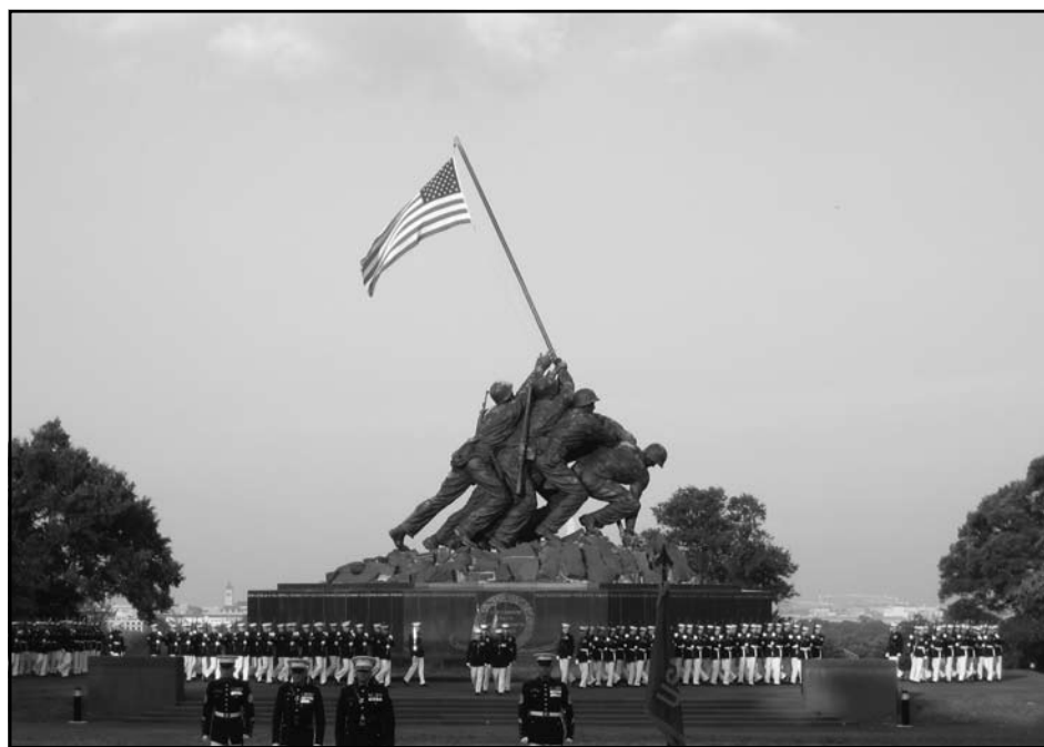
Marine Corps War Memorial, Arlington, VA

Veterans exemplify good character qualities like loyalty, courage, responsibility, respect and other traits. Find stories in your newspaper about people that exhibit both good and bad character. What choice did they make? What was the outcome? What are the good or bad character traits that they exhibited? What can you learn from them?