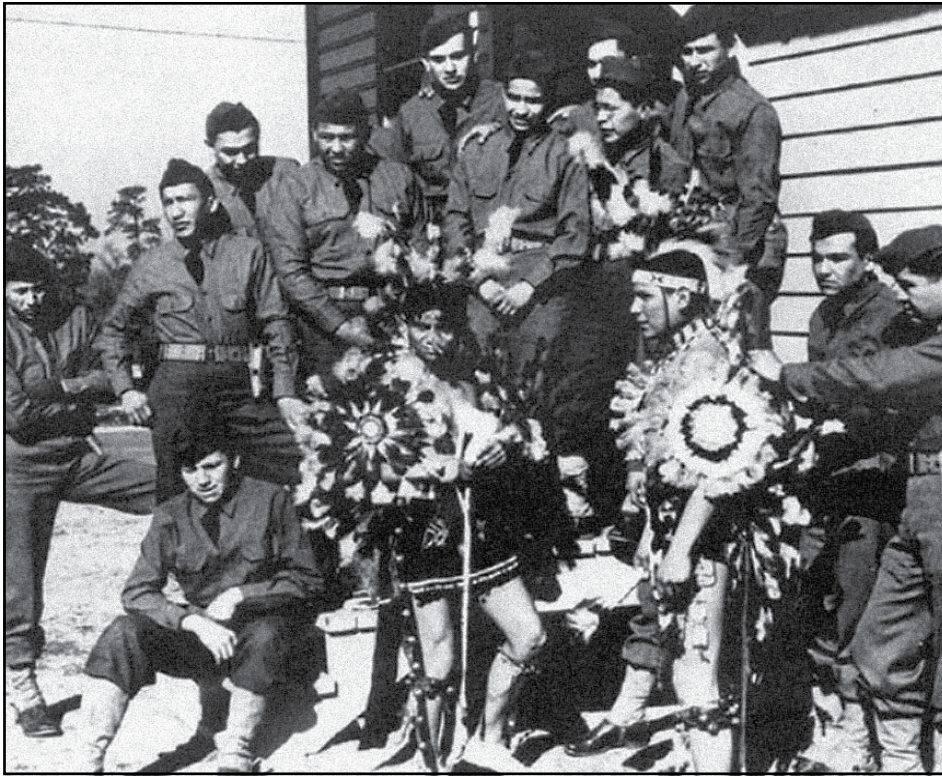
Comanche code talkers.