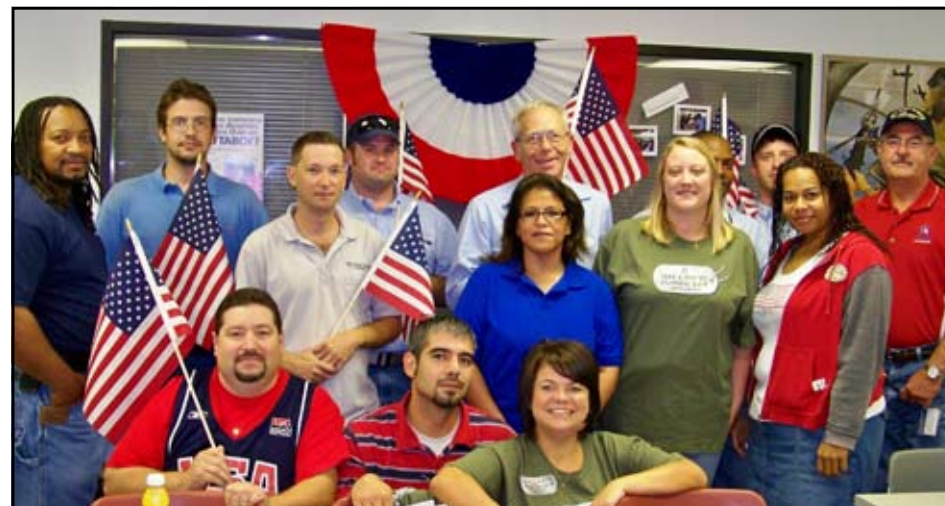
Time Warner employees celebrate “Thank a Veteran at Work Day” in Killeen, TX (near Ft. Hood) honoring veterans among the staff for their service.

Interested in getting more involved in this program or have additional questions? E-mail us at: veterans@aetn.com .