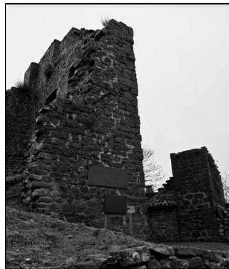
Memorial at Sommocolonia, Italy

Some historians make the case that black soldiers as a first line of defense, served as open targets for the German army. Their role was to occupy German forces in the south of Italy, making it possible to send other forces to France and Germany. Often the testimony