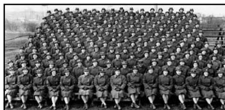
WAC training class at Ft. Des Moines, IA.

Initially, members of Congress, the press and the military establishment joked about the notion of women serving in the Army, but as America increasingly realized the demands of a war on two fronts (Japan and Germany), leaders also faced an acute manpower shortage. In May 1942, the House and the Senate approved a bill creating the Women's Army Auxiliary Corps (WAAC) and Oveta Culp Hobby, Chief of the Women's Interest Section in the Public Relations Bureau at the War Department and a lobbyist for the WAAC bill, became its first director. Although the women who joined considered themselves in the Army, technically they were civilians working with the Army. By the spring of 1943, 60,000 women had volunteered and in July 1943, a new congressional bill transformed the WAAC to the Women's Army Corps (WAC), giving Army women military status.