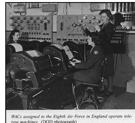
WACs assigned to the Eighth Air Force in England operate tele-type machines. (DOD photograph)

Algeria. Within a few days they were at work in Allied Headquarters. As the war continued, most overseas assignments were to the European Theater of Operations and over 8,300 served in England, France, Germany and Italy. Others deployed to the Pacific and the Far East.