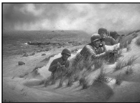
"Indian Code Talkers," painting by Wayne Cooper depicting Comanche Charles Chibitty during the D-Day landings at Utah Beach

The Code Talkers' role in war required intelligence and bravery. They developed and memorized special codes. They endured some of the most dangerous battles and remained calm under fire. They served proudly, with honor and distinction. Their actions proved critical in several important campaigns, and they are credited with saving thousands of American and allies' lives.