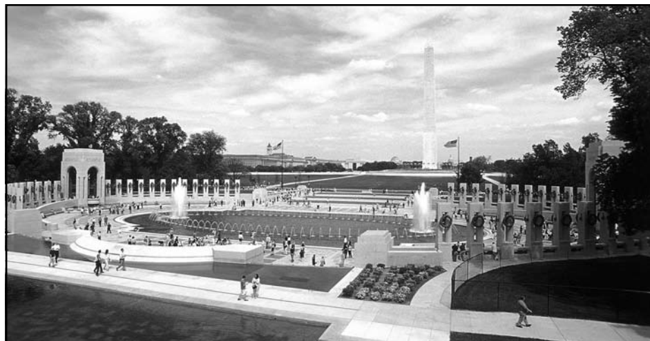
World War II Memorial, Washington, DC.

Today, Veterans Day is still observed on November 11th as a national holiday to honor all veterans of the United States Armed Forces. Throughout the nation, Americans participate in parades, ceremonies, and observances to pay their respects to our former servicemen and women.